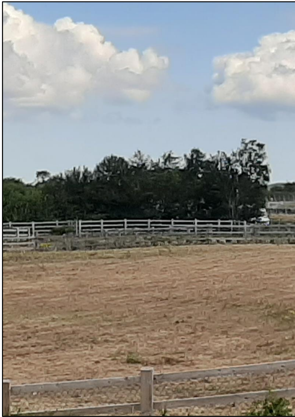
Weed Treatment Area

The map below shows the location of the approach lights on the western side of North Runway. The heights of the masts vary, but on the west they are just over 9m to the extreme west, dropping to 6.3m closer to the runway end.